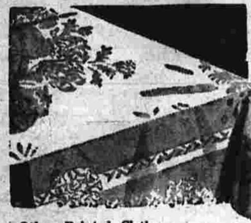
Other Printed Cloths To $4.98

Reproductions of antique cloths in ranges to fit all pocket books. 80x80, 72x90 and some in sets with matching scarfs for server and buffet.